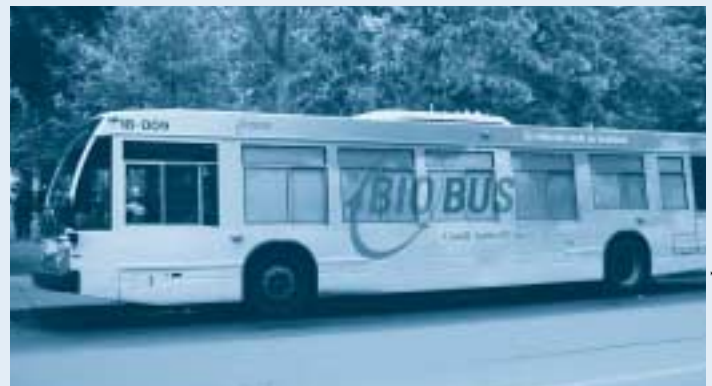
Société de transport de Montréal

Canada's first hybrid diesel-electric bus entered regular service in Kelowna, B.C. in May 2005