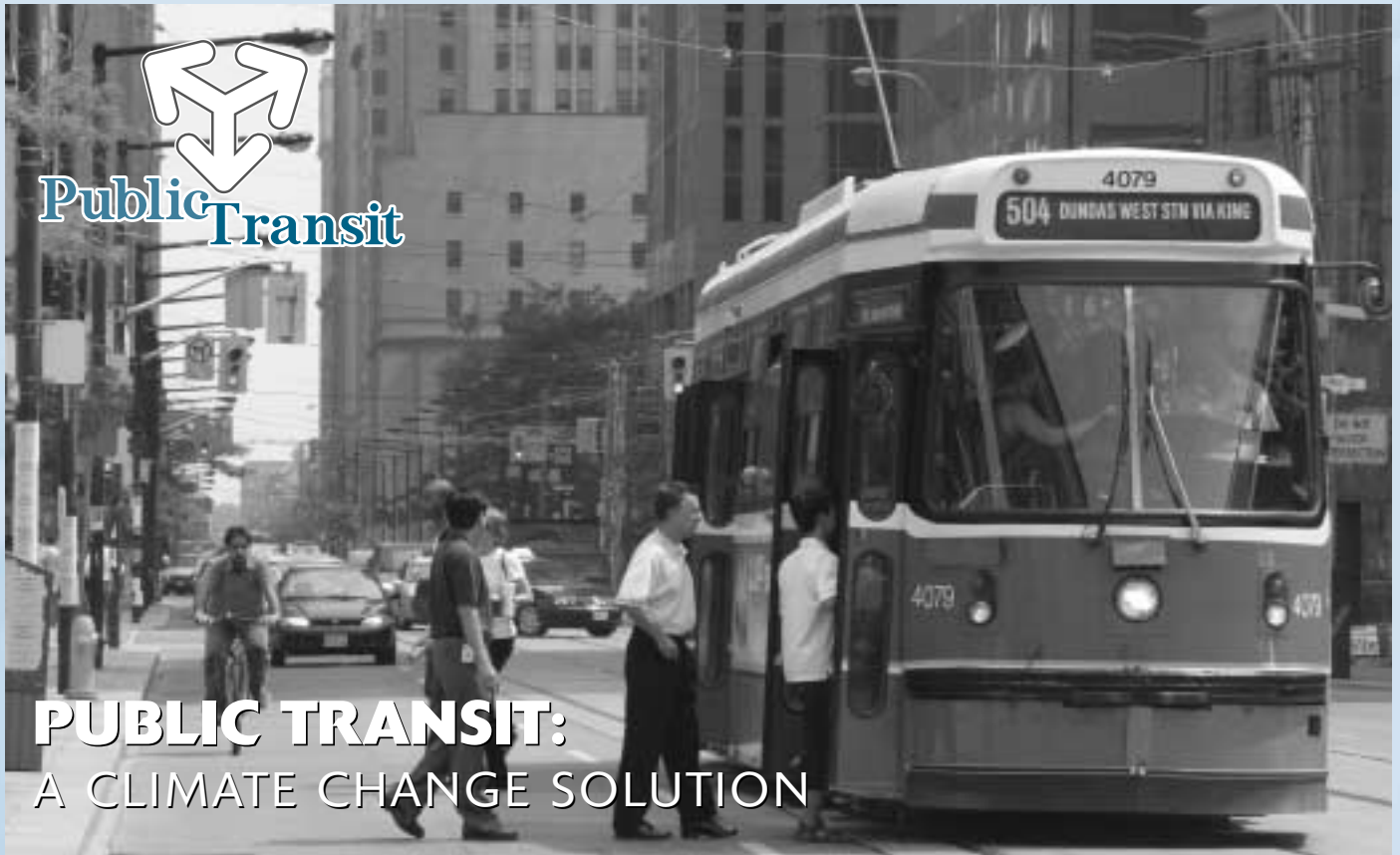
Toronto Transit Commission