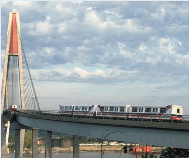
Greater Vancouver Transportation Authority

To address broader security needs, TransLink has completed an assessment of hazards, risks and vulnerabilities, a needs analysis and a strategic risk review. These studies have led to several programs supported by Transit-Secure including facility hardening to prevent and detect infiltration, training for first responders, closed-circuit video enhancement in SkyTrain stations (with possible future integration of facial and behaviour recognition), and emergency voice alarms and displays in transit facilities. TransLink is also developing a mobile command system to remotely direct the Emergency Operations Centre in the event that an incident restricts physical access.