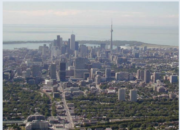
Toronto Transit Commission

York Region Transit. York Region Transit has initiated several safety and security initiatives including the installation of video monitoring systems in 150 buses and three terminals. It is expanding its computer-aided dispatch and automated vehicle location system, including a covert emergency microphone, to more than 100 buses in addition to the 86 rapid transit buses already equipped. With Transit-Secure funding, the system is also undertaking a risk assessment and security plan.