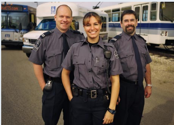
City of edmonton

Edmonton Transit System (ETS). A $2.25-million contribution by Transit-Secure is helping ETS improve safety and security. Initiatives include a comprehensive threat vulnerability risk assessment, video monitoring system upgrades, and a comprehensive public awareness campaign modelled after the Transit Watch program from the National Transit Institute in the United States. Over 1,700 ETS operations, administrative and maintenance employees have attended a two-hour training session on terrorism awareness, recognition and response. This instruction on dealing with dangerous and suspicious activities enabled the integration of all ETS staff into the "Security is Everyone's Responsibility" mandate.