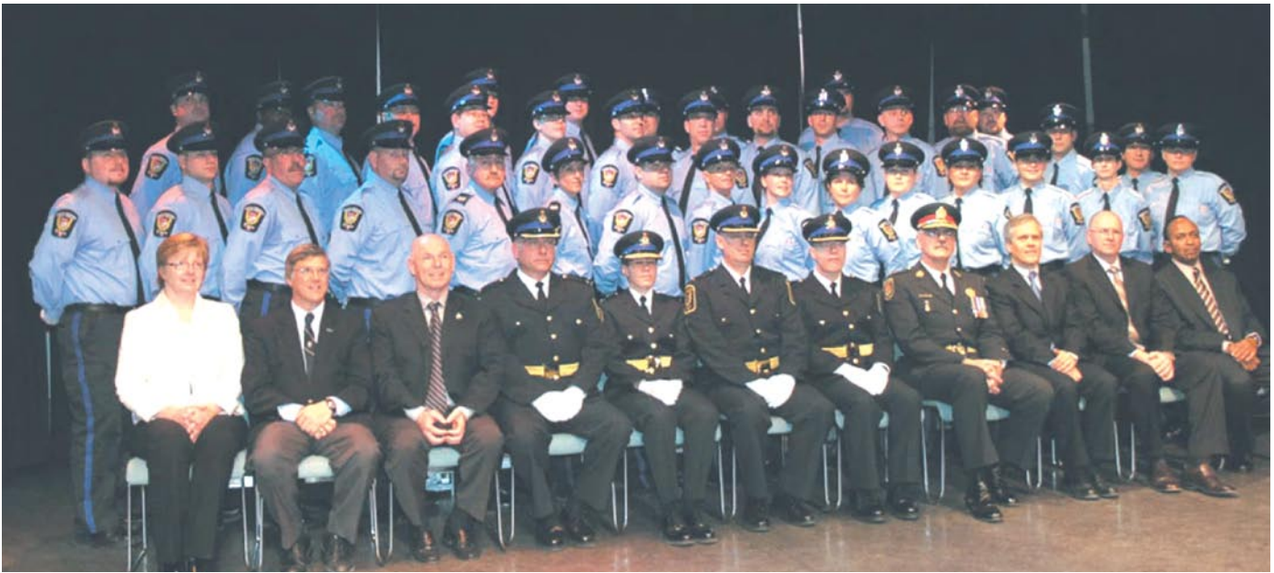
City of Ottawa