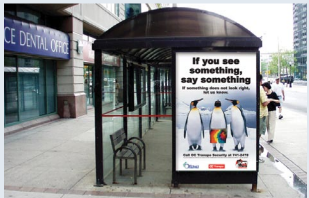
Bus shelter poster promoting customer awareness of possible security threats

In previous initiatives, OC Transpo employees were given educational materials based on those developed by the U.S. National Transit Institute and London Underground, and received police training on terrorist indicators and bomb threat response. A parallel customer campaign encouraged passengers to identify and report suspicious items, persons or activities, and used shelter posters, interior bus cards and brochures based on those developed by New York's Metropolitan Transit Authority.